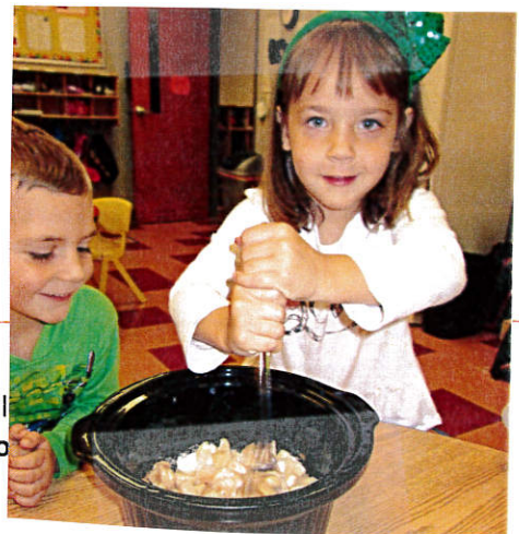
Mixing it up